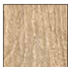
Sonoma oak colour