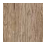
Sanremo oak light colour