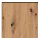
Artisan oak colour