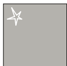
high polish soft grey